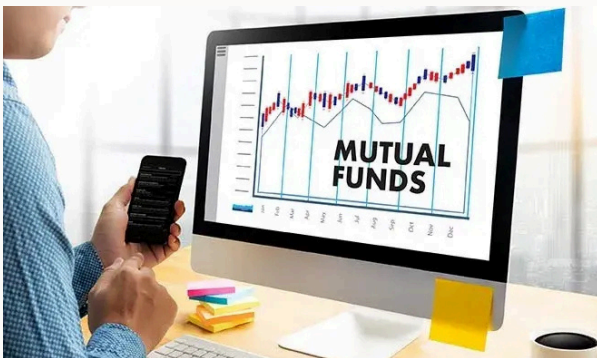
MUTUAL FUND ADVISORY